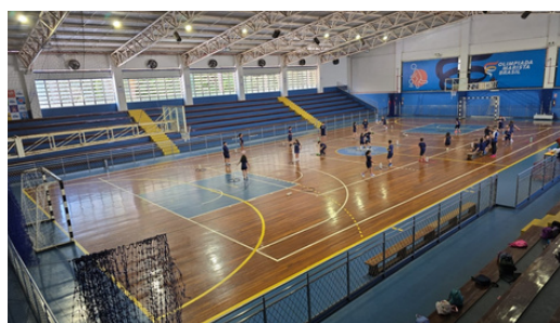
Ginasio do colégio Marista de Brasilia Ensino Medio - Maristinha

ASCAD – Associação dos Servidores da Câmara dos Deputados