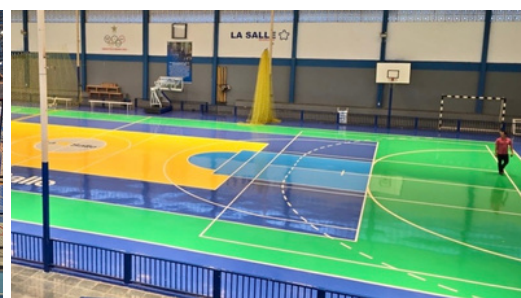
Ginasio do colégio La Salle de Brasília