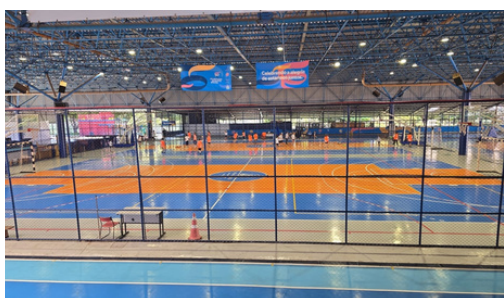
Ginasio do colégio Marista de Brasilia Ensino Medio - Maristão